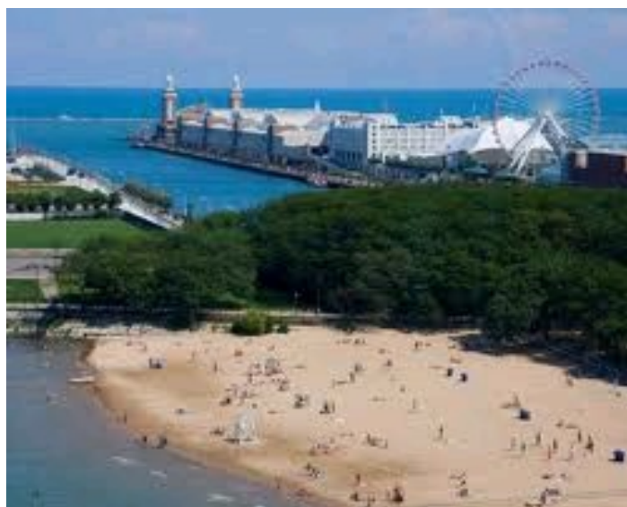
A Chicago Beach with Navy Pier in the background